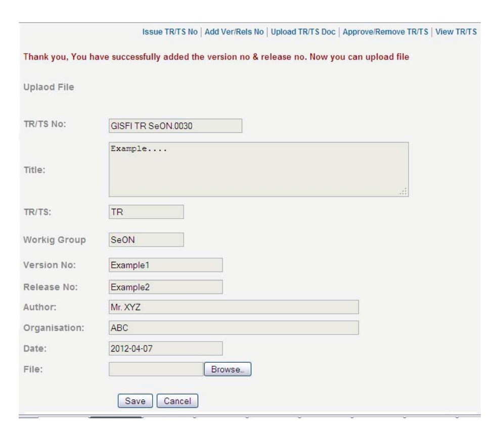
Step 4 After successful uploading of the file the following screenshot will appear: